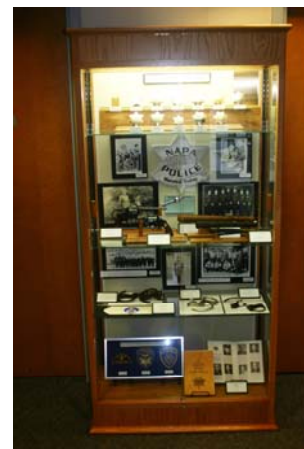
The NPBS display case, in the public lobby of the NPD.