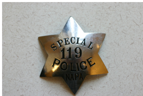
NPD Special Police Badge

The second item is a gold tie-bar with “Napa” and a revolver displayed on it. This piece was located at the “Porky D. Swine” police collectors show in Southern California. Research indicates these tie-bars were worn by members of the NPD pistol shooting team in the 1950s.